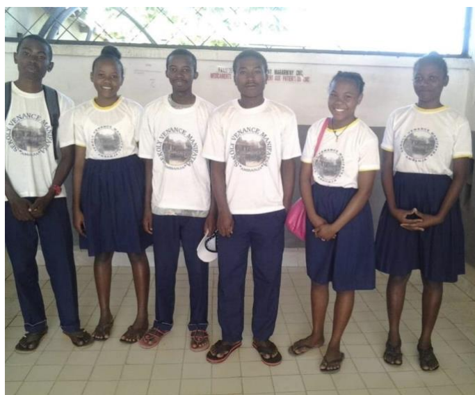
Promotion day at the Lycée SEVEMA (Ambanja) in June 2020