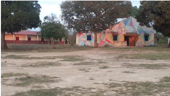
Saint Joseph school in Maherivaratra