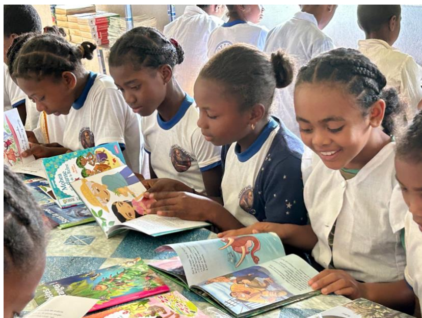
Students at Saint Laurent school in Beandrarezona enjoy reading books in the library (May 2023)