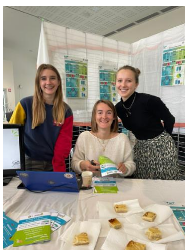
Students from the IMT Atlantique engineering university in Nantes, France volunteered to collect books for Boky Mamiko