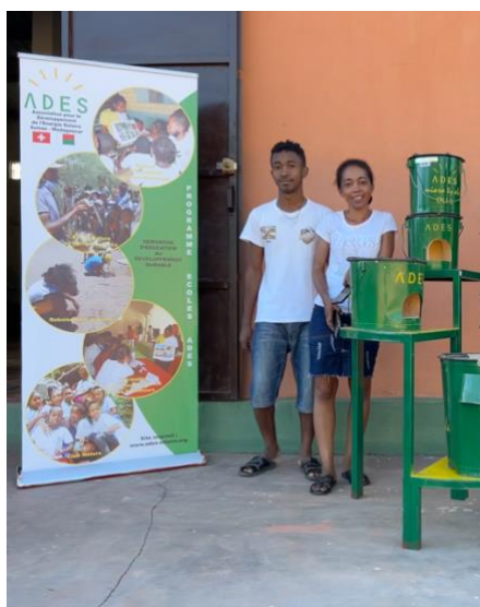
Our visit to ADES in Antsohihy (May 2023)