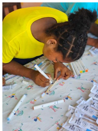
The girls at Casa Pasquale proudly wrote their names on their new bamboo toothbrushes (October 2023)