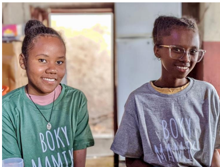
...and at Université Catholique de Madagascar (UCM) in Antananarivo