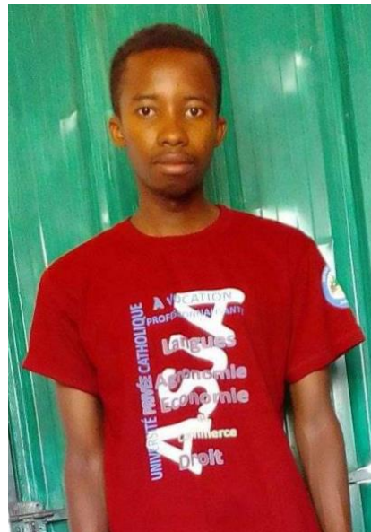
Our university bursary students at Athénée St Joseph in Antsohihy (ASJA)...