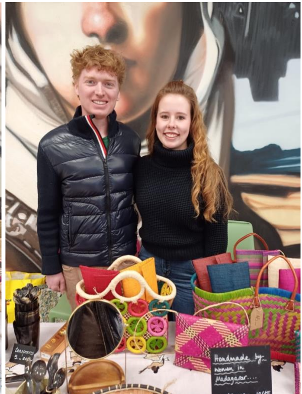
Snapshots at our Christmas charity sale at Parco Grancia (Lugano)