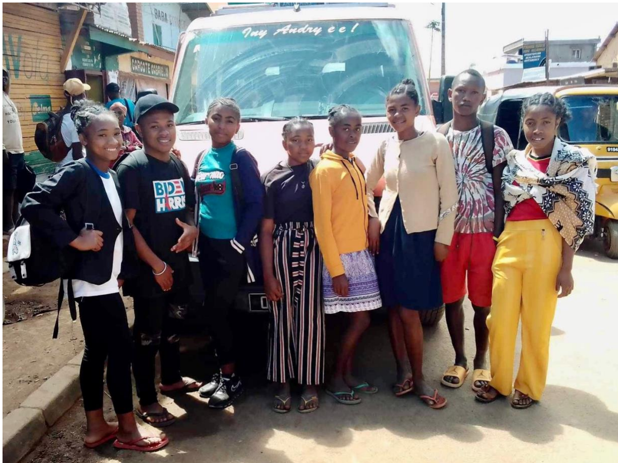
Our high school bursary students from Beandrarezona ready to start off a new school year at Casa Pasquale – St Joseph school in Maherivaratra (September 2023)