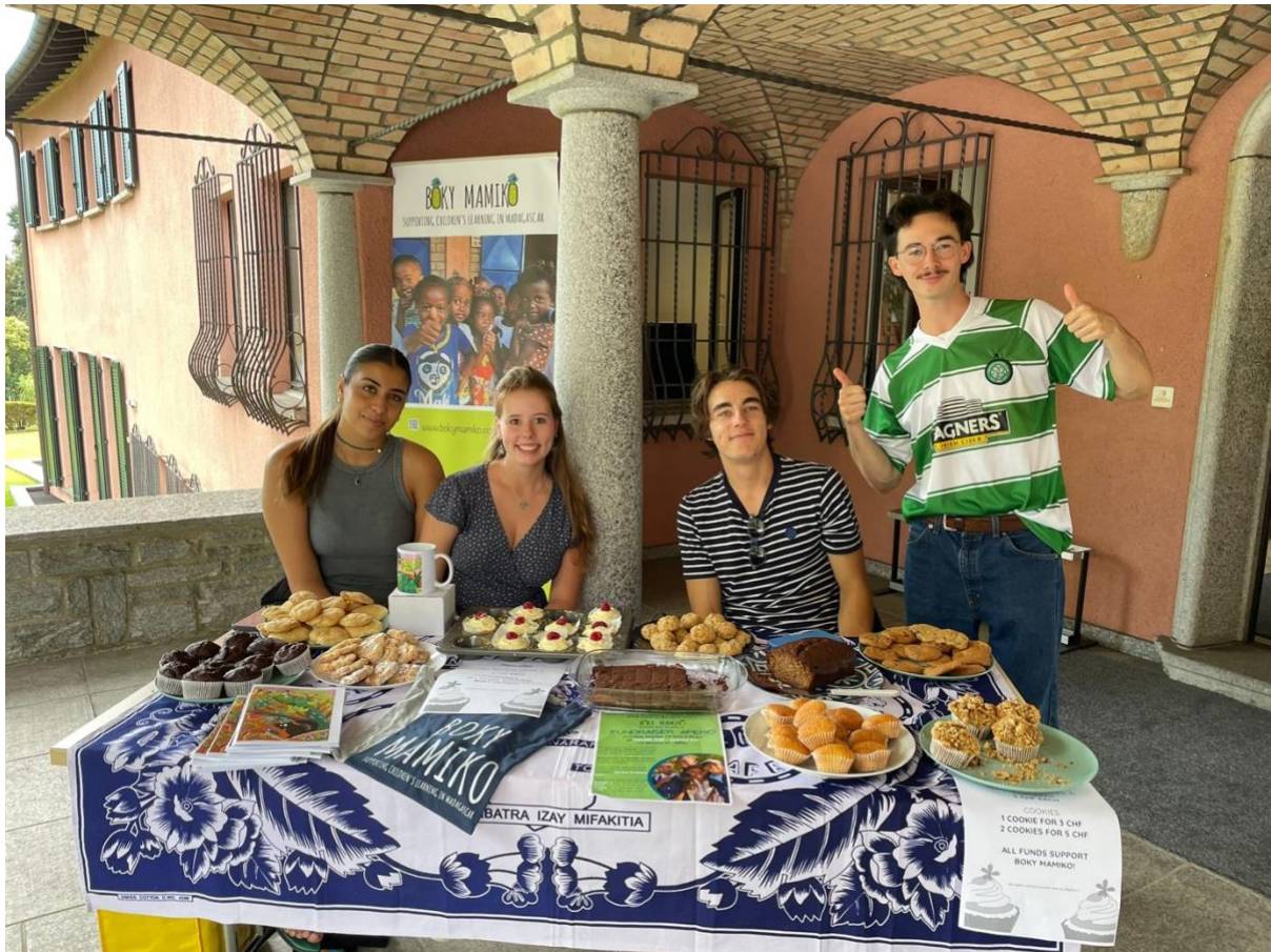
A charity bake sale organized by students at Franklin University Switzerland