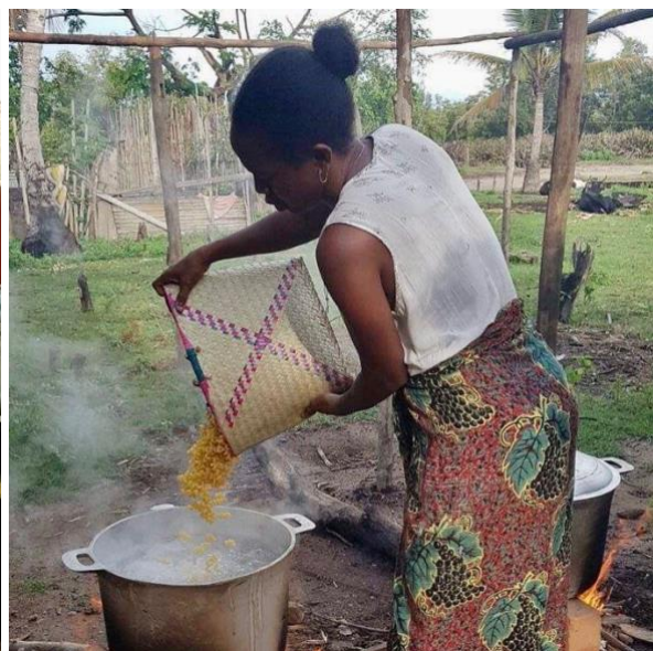
The cooks of St. Laurent and Mamiko school canteens