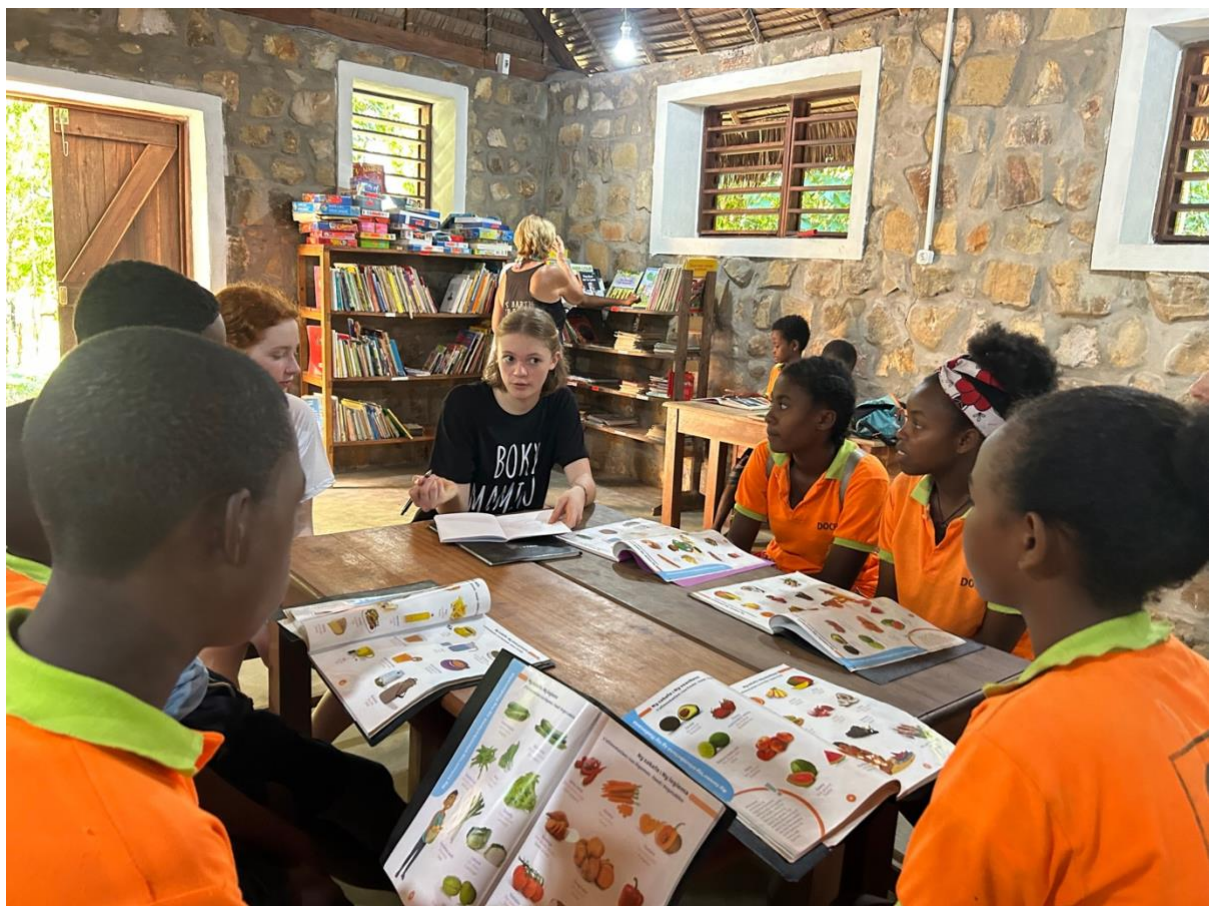
Students at Docenda discussing their eating habits with Boky Mamiko volunteers

The study concludes that to restore healthy levels of vitamins and minerals in the blood, the sustainable solution would be intake by diet. This could be achieved through nutritional education. However, the significant financial and infrastructural limitations of rural areas in Madagascar, together with a strong cultural tie to rice, suggest that in the short run a more efficient solution could be to integrate the students' diet with vitamin B and iron, calcium and magnesium complex supplements.