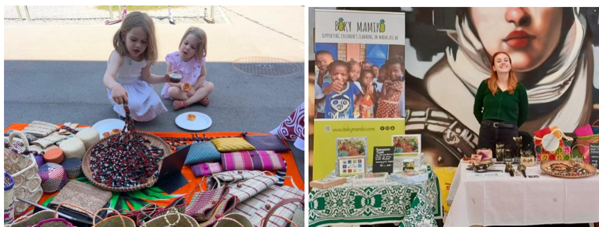
Our Summer and Christmas markets in Zurich and Lugano, Switzerland