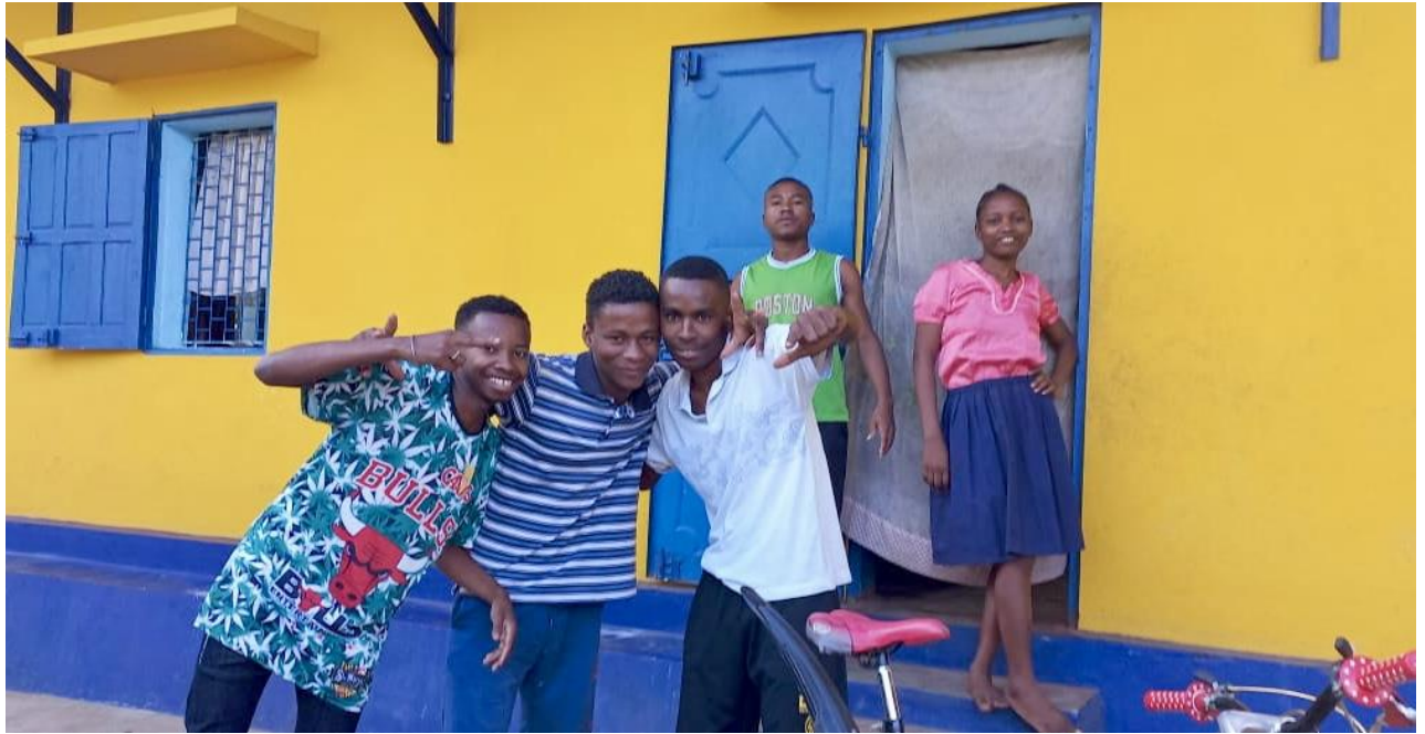
Our bursary students the day before their high school final exams: their good spirit was a premonition of their success! (July 2023)