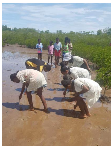
Planting mangroves at the Mamiko school mangrove reforestation day (February 2023)