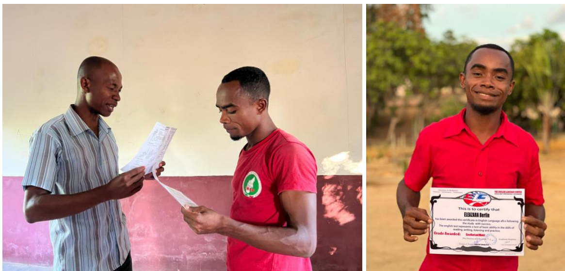
Teachers practicing English conversation and proudly showing their English language certificate