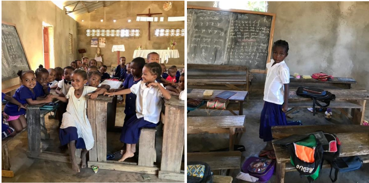
Students of the S. Giovanni XXIII school in Beramanja

We are also in regular contact with the directors of several other schools and universities attended by Boky Mamiko bursary students, including the high school SE.VE.MA. in Ambanja, the Institut Supérieur Pédagogique d'Antananarivo (ISPA), the Institut Supérieur Paramédicaux Sambirano (ISPS), the Athénée St Joseph in Antsohihy (ASJA), the Université Catholique de Madagascar in Antananarivo, the Ecole Supérieure Polytechnique d'Antsiranana in Diego Suarez, and the vocational hotel school Wings of Change in Nosy Be. The directors of these institutions keep us informed about the academic results and the health status of our bursary students.