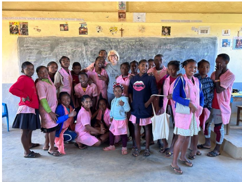
Students at Saint Laurent school in Beandrarezona

In 2021 we started collaborating also with Saint Laurent school in Beandrarezona , a rural village near Bealanana, a town in a landlocked region south of Ambanja. About 400 students , from pre-school to secondary school, attend St. Laurent. Boky Mamiko provides this school with textbooks and books for the school library, as well as with financial support to pay the teachers' salaries and to run the school canteen, attended by 90 students daily in 2023. In 2022 we also funded the construction of the school canteen, vegetable garden, and toilets. Moreover, nine of the students who received Boky Mamiko scholarships in 2023 are originally from the village of Beandrarezona.