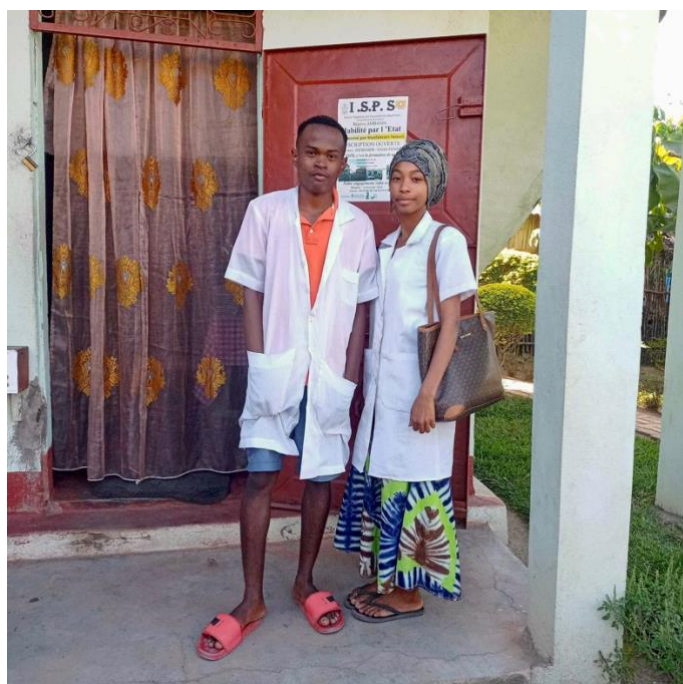
...and the degree program in nursing at the Institut Supérieur des Paramédicaux Sambirano (I.S.P.S.)