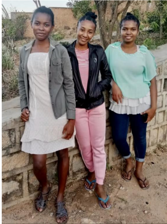
Our bursary students attending the Teacher Education program at the Institut Supérieur Pédagogique d'Antananarivo (I.S.P.A.)...