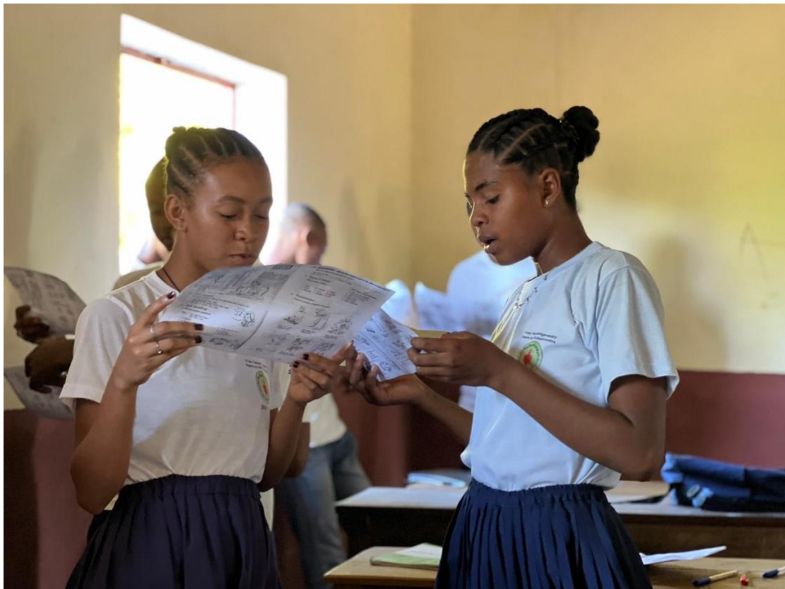
Students at the English conversation holiday camp at Casa Pasquale in September 2023