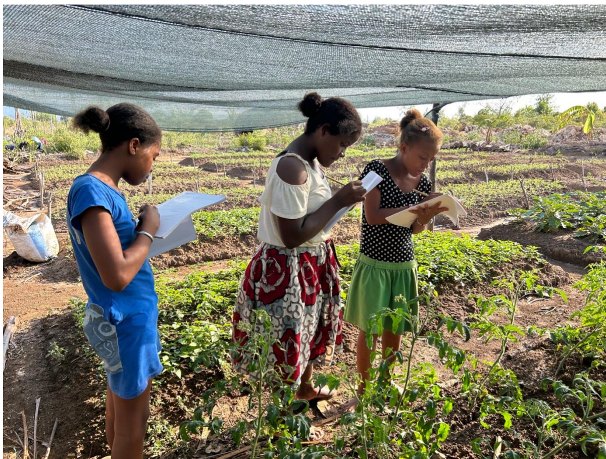
Experiential learning: conducting a field research in the vegetable garden of Casa Pasquale

On the last evening, every group showed to the whole community what they had learned and created. A heartfelt debate, colorful posters representing the type and quantity of different plants at Casa Pasquale’s garden, and the first issue of a school newspaper were the amazing results of these workshops. The enthusiasm of the students was heartwarming and confirmed that experiential learning is key for a long-lasting, holistic education.