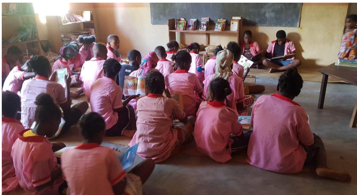
A reading session at Mamiko school in Djangoa