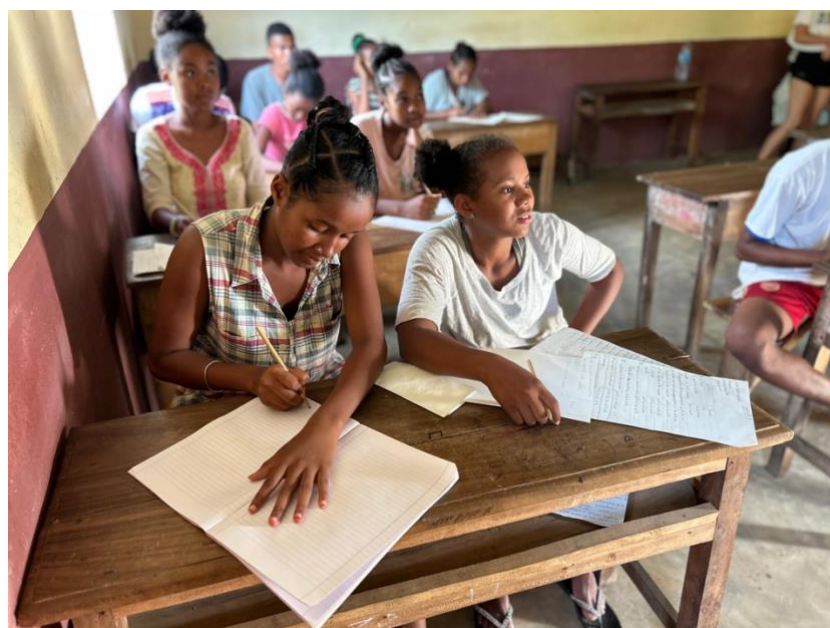
Students at Saint Joseph high school in Maherivaratra

In 2021 we started a collaboration with Saint Joseph school in Maherivaratra , which lies about 20 kilometers north of Ambanja. This school has 420 students , from nursery school to high school. The school is connected to Casa Pasquale , a student shelter hosting 93 students, of which 27 receive a Boky Mamiko full-board scholarship . Besides the scholarship program, Boky Mamiko supports St. Joseph school and Casa Pasquale financing books, teachers' salaries and training, health and nutrition, and infrastructure and maintenance. We also created a library for Casa Pasquale and funded the development of large vegetable garden.