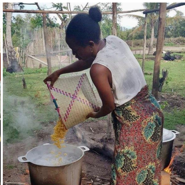
The cooks of St. Laurent and Mamiko school canteens