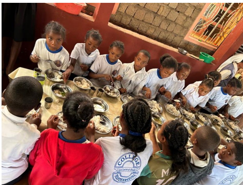
School meals act as an incentive to go to school and help to boost children's learning ability