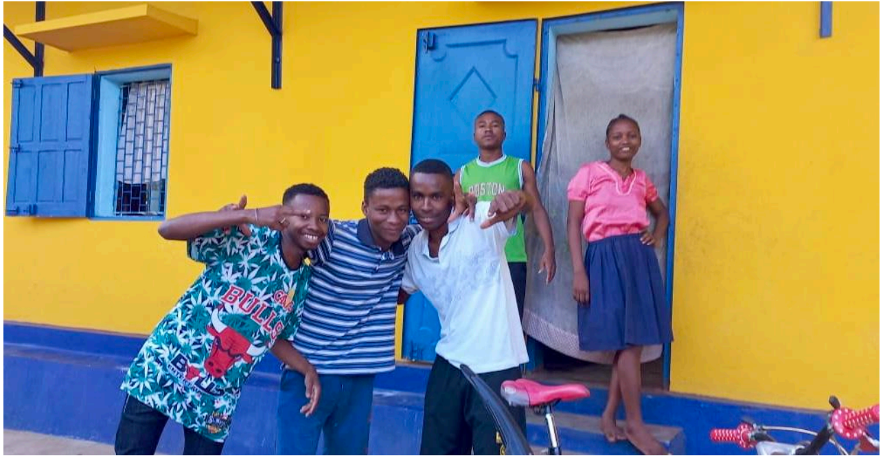
Our bursary students the day before their high school final exams: their good spirit was a premonition of their success! (July 2023)