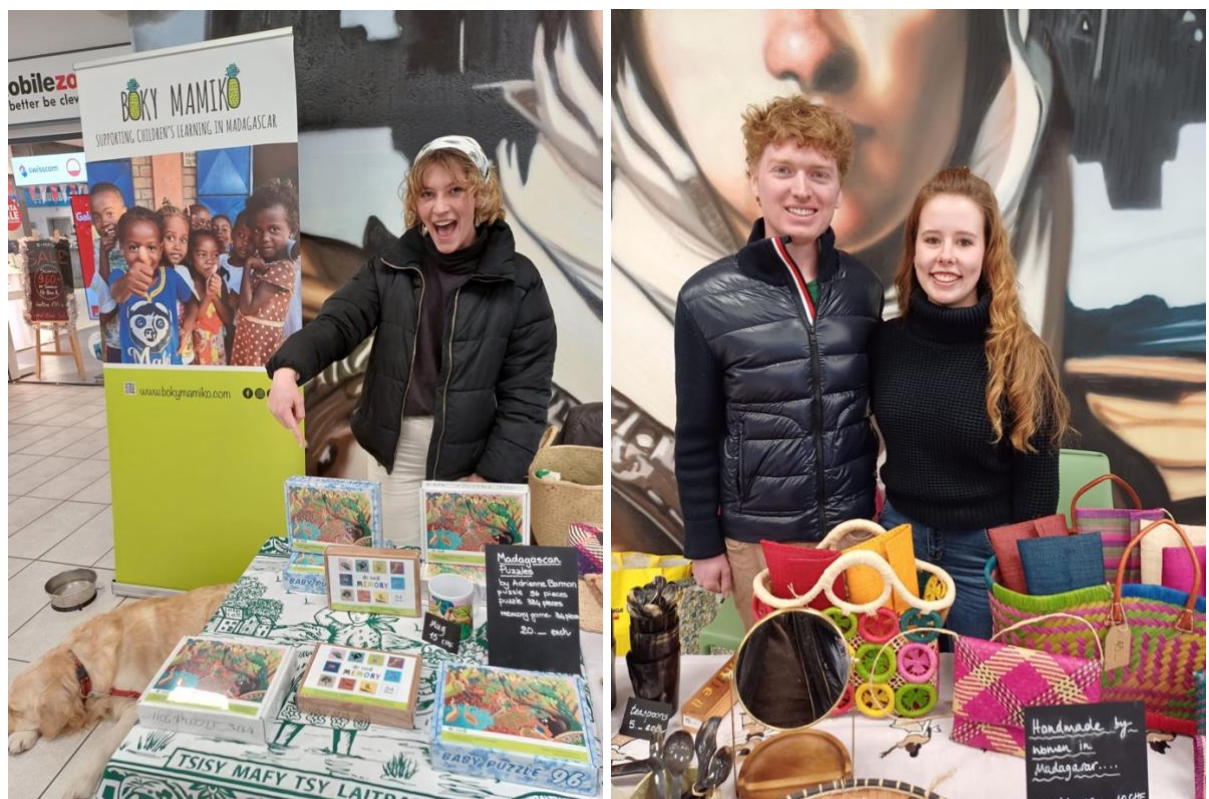
Snapshots at our Christmas charity sale at Parco Grancia (Lugano)