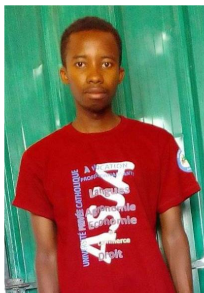
Our university bursary students at Athénée St Joseph in Antsohihy (ASJA)...