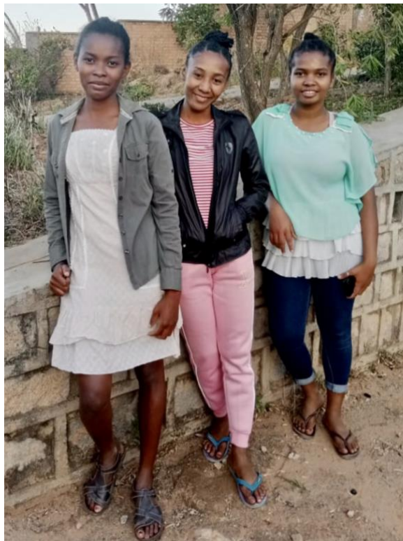
Our bursary students attending the Teacher Education program at the Institut Supérieur Pédagogique d'Antananarivo (I.S.P.A.)...