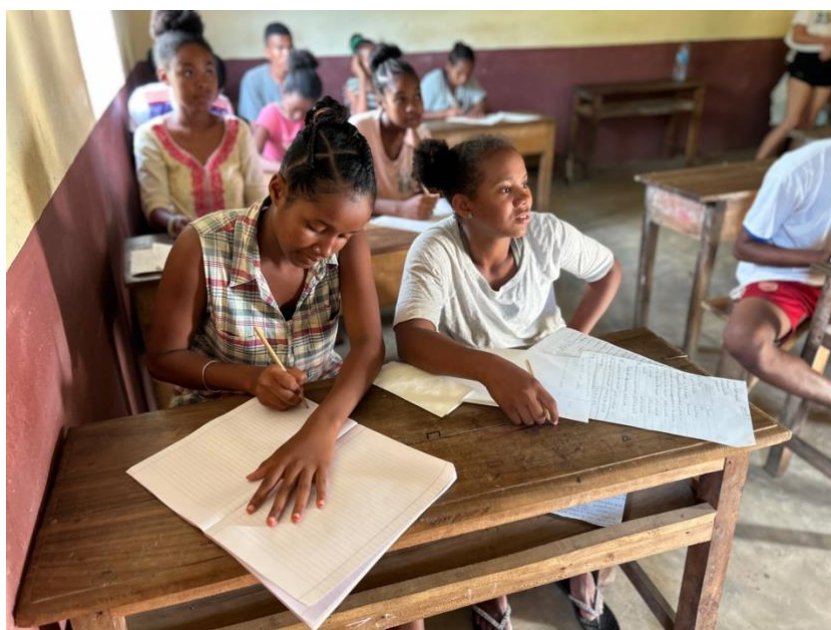
Students at Saint Joseph high school in Maherivaratra

In 2021 we started a collaboration with Saint Joseph school in Maherivaratra , which lies about 20 kilometers north of Ambanja. This school has 420 students , from nursery school to high school. The school is connected to Casa Pasquale , a student shelter hosting 93 students, of which 27 receive a Boky Mamiko full-board scholarship . Besides the scholarship program, Boky Mamiko supports St. Joseph school and Casa Pasquale financing books, teachers' salaries and training, health and nutrition, and infrastructure and maintenance. We also created a library for Casa Pasquale and funded the development of large vegetable garden.