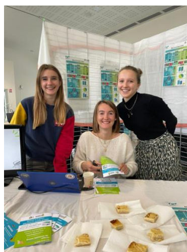
Students from the IMT Atlantique engineering university in Nantes, France volunteered to collect books for Boky Mamiko