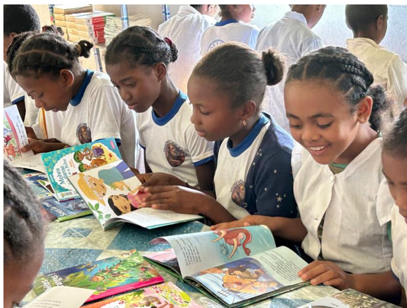
Students at Saint Laurent school in Beandrazona enjoy reading books in the library (May 2023)