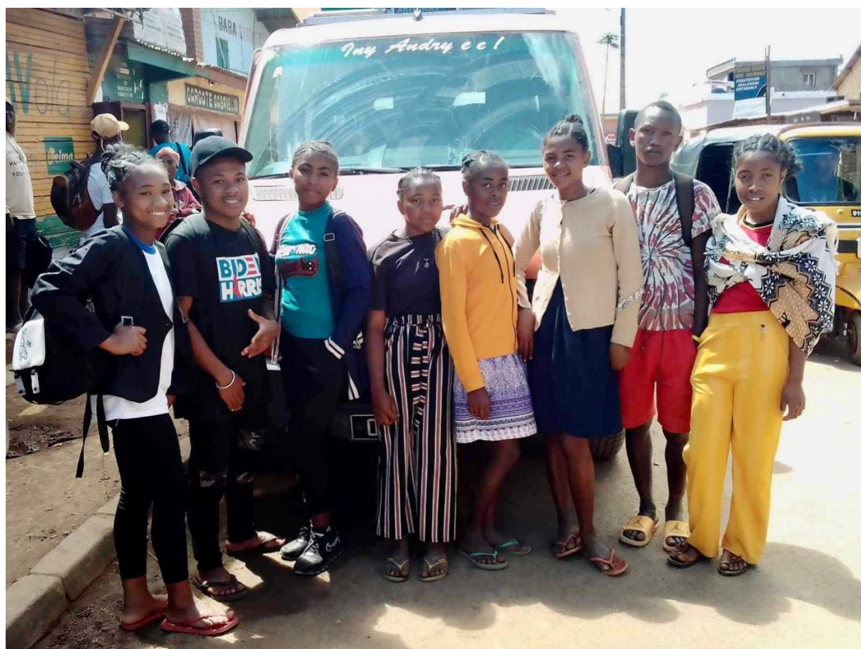
Our high school bursary students from Beandrarezona ready to start off a new school year at Casa Pasquale – St Joseph school in Maherivaratra (September 2023)