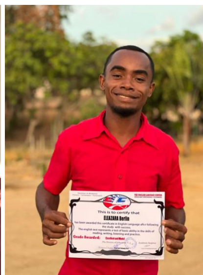
Teachers practicing English conversation and proudly showing their English language certificate