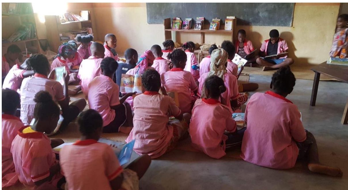
A reading session at Mamiko school in Djangoa