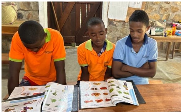
Students during a reading session at Docenda school in Anjanojano

In 2019 we started a collaboration with Docenda , a school located in the remote village of Anjanojano , only reachable by boat (or rather pirogue) from Ankify, the port connecting the main island to the island of Nosy Be. The school was founded in 2012 by Ms. Irène Petit, president of the French NGO Docenda , and it offers free education to 177 children between the ages of 3 and 18. About half of these children walk more than one hour through the forest to go to school every day. The other half come from even more distant villages (several hours of pirogue) and therefore stay in Anjanojano during the school year. Our collaboration with Docenda includes the provision of books and learning materials , financial support for the construction of the school library in 2022, as well as the co-management of our high school scholarship program . In fact, eleven of the students who received Boky Mamiko scholarships in 2023 completed their lower secondary education at Docenda.