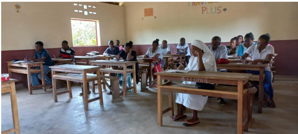
French language training for the teachers of St Joseph school in Maherivaratra, September 2022