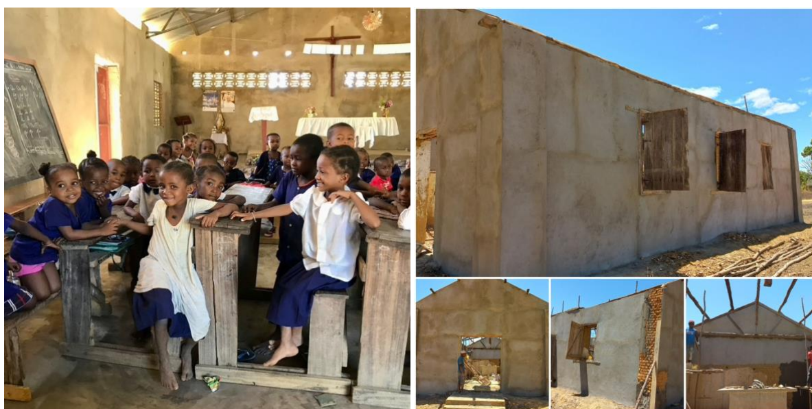
School takes place in Beramanja's church while waiting for the school construction works to be completed

Boky Mamiko contributed to the repair of the school building and will support the new school with books, didactical materials, and a teacher's salary.