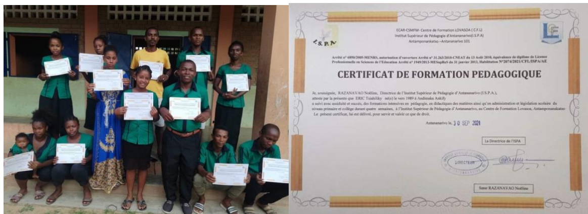
The Mamiko teachers received their certificates of pedagogy training in April 2022