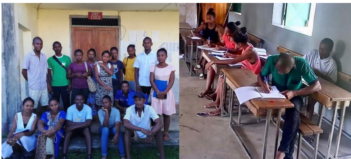
Docenda and Mamiko teachers at a pedagogy training in April 2022 in Ambanja

At the request of the teachers themselves, in 2022 Boky Mamiko's teachers' training actions focused on French. We organized three intensive French language courses attended respectively by the teachers of Docenda, Mamiko and St Josph schools. It is heartwarming to see how these teachers are ready to sacrifice a period of holiday to work on their learning and improving their skills!