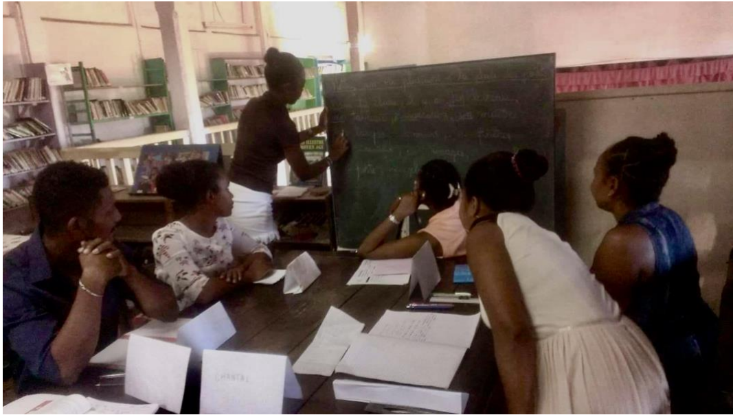
French language training for the Docenda teachers at the Alliance Francaise in Nosy Be, July 2022