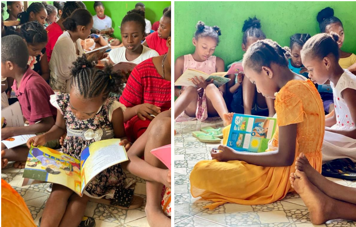
The library of Casa Pasquale is densely populated!

Having a library at hand is a rare luxury in rural Madagascar. All the girls and boys seem to have perceived the value of this opportunity and go to the library every time they can!