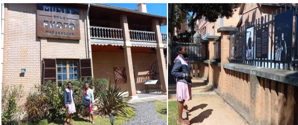
Visit to the photography museum in Antananarivo