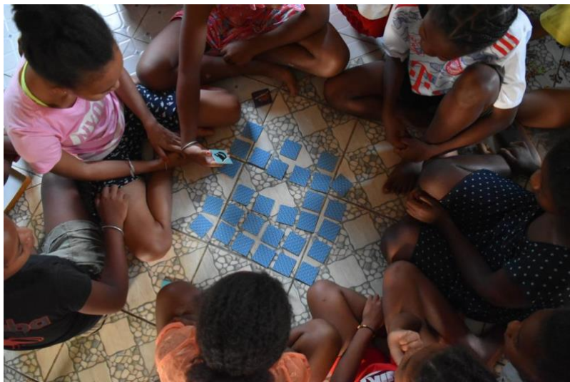
Playing in the library of Casa Pasquale