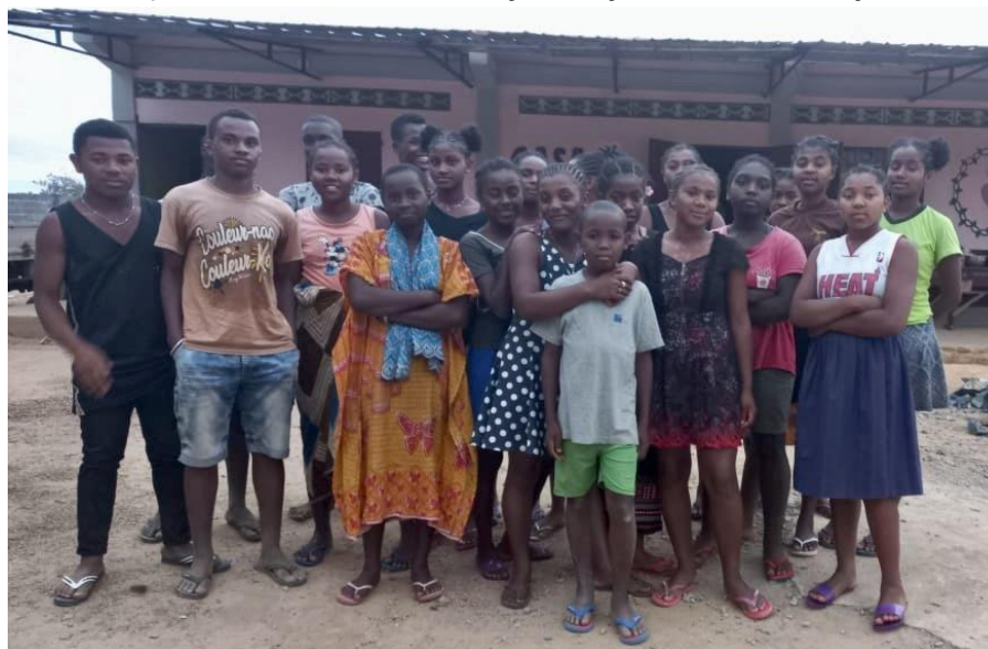
The bursary students living at Casa Pasquale in Maherivaratra in school year 2022-2023