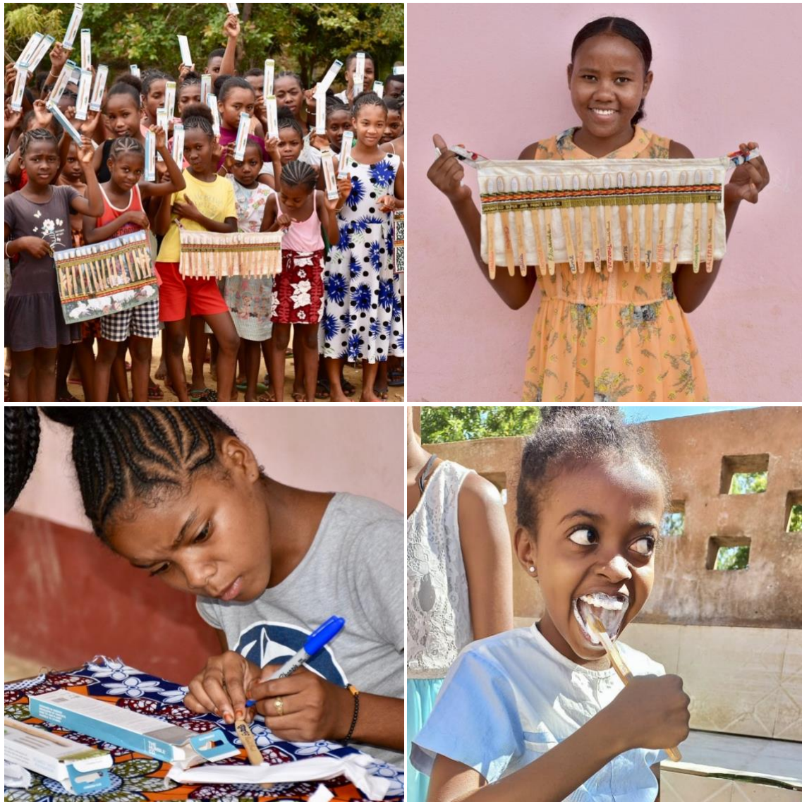
The new toothbrushes are very welcome at Casa Pasquale!

The toothbrushes were received with enthusiasm by the girls and boys of the shelter Casa Pasquale. With festive mood, each of them wrote their name on their toothbrush and proudly uses it every day. ☺