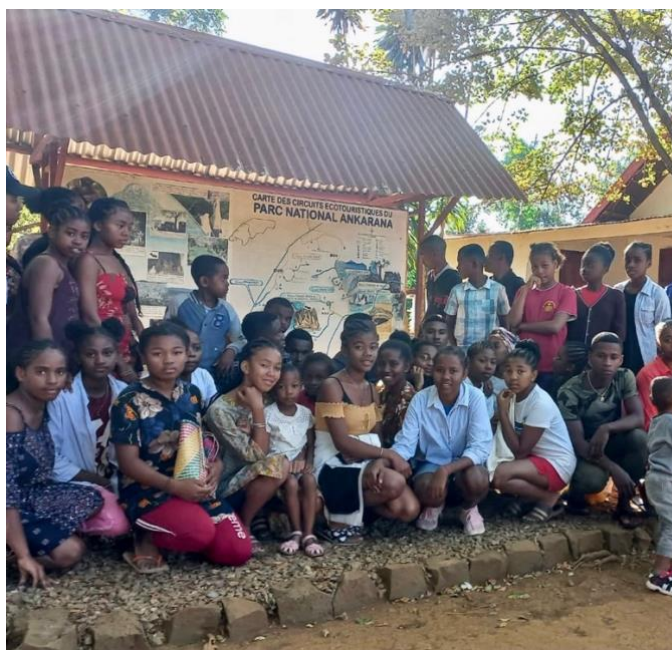
Our bursary students at Alliance Française in Ambanja and at the National Park of Ankarana