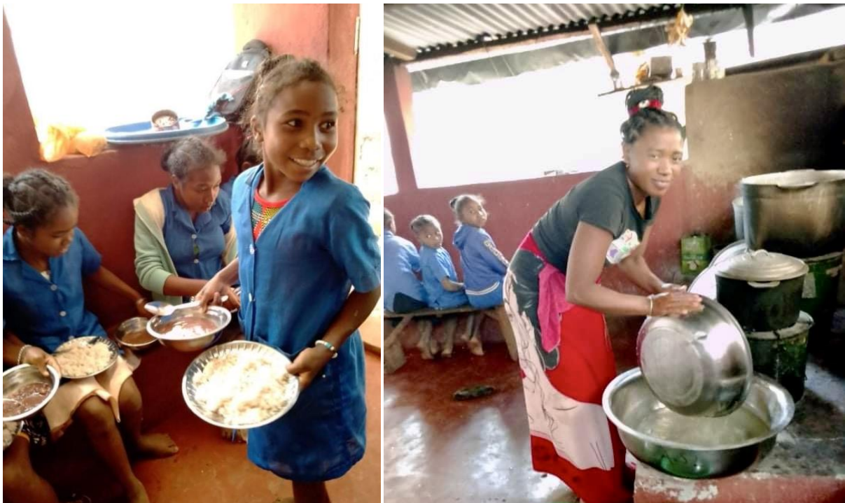
The school canteen in Beandrazona is daily attended by over 50 children. It also provides an employment opportunity for the students' mothers.

In order to support the children's diet with vitamins in an economically sustainable way, we also financed the creation of a vegetable garden for the school. Moreover, to maximize the impact of our actions on the local community we pay a salary to a student's mother to work as cook in the canteen.