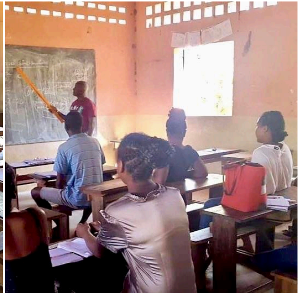
French language training for the Mamiko teachers in Djangoa, August 2022